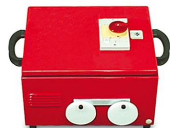
Figure 3 Pipe deburring machine Transfluid RE 642 A

The rotary motion of the tool is used to remove the external burr from the pipe. The technology is characterized by its high productivity and reliability. After tool change, a deburring machine (e.g. Transfluid RE 642 a – see Figure 3 ) can also be used to remove internal burrs. When deburring larger pipe diameters (greater than 40 mm), the use of experienced operators is advisable due to the increased skill requirements.