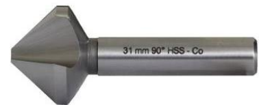
Figure 1 Countersink for removing internal burrs at pipe ends

A countersink designed for countersinking holes can be machined by creating a hole in its axis along its entire length. Through this hole, compressed air flows towards the mandrel, through which it flows backwards on the outside to remove the metal chips that have formed. The modified countersink ( Figure 1 ) is clamped in a machine holder which creates a rotary movement of the countersink around its axis. It is used after cutting the pipes on the lathe by shearing (using a circular knife and an internal mandrel) to remove burrs on the inside of the pipes.