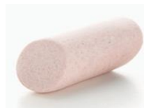
Figure 7 Ceramic grinding wheel

A pipe with an outer diameter of 25.1 mm, a wall thickness of 0.6 mm, and a joint length between hole centres of 143 mm ( Figure 8 ) made of 1.4541 was used for the analysis of the plastering technology. The deburring