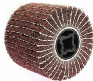
Figure 5 Grinding roller used for removing external burrs on pipe ends