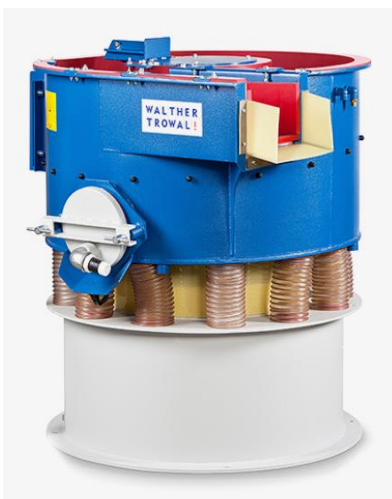
Figure 6 Vibrating machine CF 300 from Walther Trowal

A vibratory plastering machine CF 300 from Walther Trowal was selected to assess the plastering technology ( Figure 6 ). The vibrating vessel works on the principle of vibration by vibrators. This reduces the processing time by up to 50–70 % compared to tumbling. There is also less chance of damage-prone products. The vibrating machine is equipped with two working speeds. For separation of the parts to be plastered, the vibratory machine is equipped with a pneumatic separating flap with a separation zone. The specifications of the CF vibratory machine from Walter Trowal are shown in Table 1 . Ceramic abrasive bodies ( Figure 7 ) are used for plastering, which removes the burr on the cut end of the pipe in a suitable stepwise manner. These rollers are 12 mm in diameter and 30 mm long.