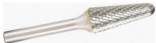
Figure 2 Technical milling cutter for deburring internal burrs on pipe ends

This is the use of a powered technical milling cutter ( Figure 2 ) designed for manual machining. To use this technology correctly, it is necessary to install a backing plate that is perpendicular to the axis of the rotating tool. In this plate, there is a hole of adequate size for the technical milling cutter to be repositioned to the plane of the support plate. By resting the end of the pipe against the backing plate, the perpendicularity of the face of the hole to the tool is ensured. This method can be used for pipes with larger end diameters that are to be free of internal burrs.