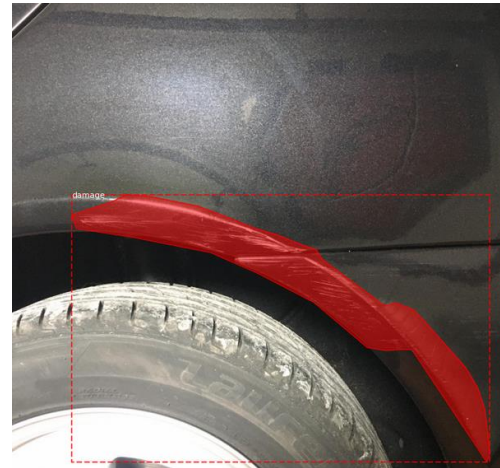
Figure 7 Result of the detection

The conducted research highlighted the imperfections in identifying damages usually caused by the influence of external factors hindering the entire process. One of the problems is interpreting dirt on the car body and its embossing as alleged damage. In order to avoid it, it would be necessary to introduce photos of dirt and creases to the model and to use the learning process with a critic who would negatively evaluate the situation. Another problem is that the car body is covered with water, which causes some of the scratches to be filled with it, giving a temporary illusion of their absence, and the space created by the reflection of light from water drops is interpreted as a detected damage. The paint color is also a problem for the model. The amount of data to be taught is not commensurate with the amount of colors available on the market, which may lead to distorting the results obtained. Test images were grabbed without any professional lightning, which would help to achieve the image without the shade effect, which also is a source of potential detection errors.