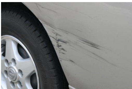
Figure 2 An example image of damaged surface