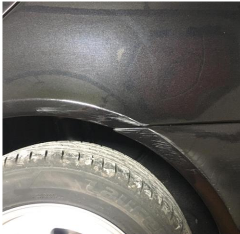
Figure 6 Image of damaged fender