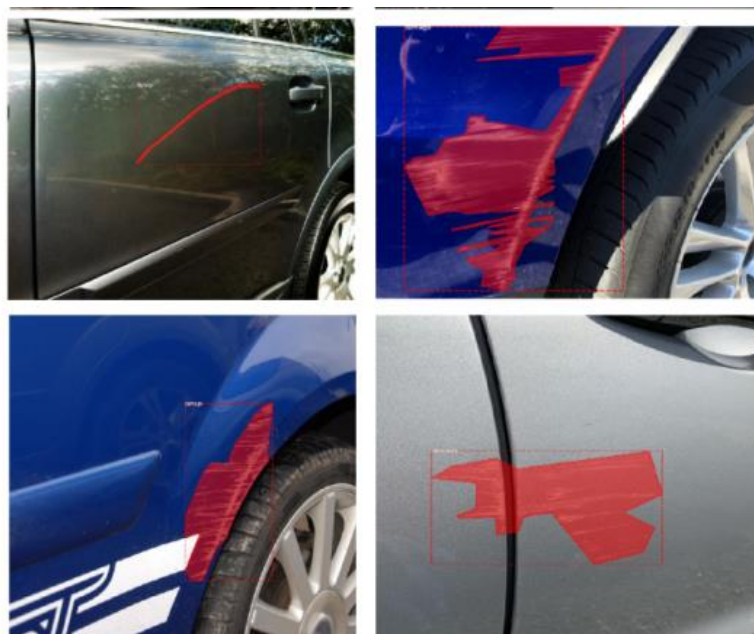
Figure 5 Images with the added Bounding boxes covering detected damaged surface

Bounding boxes are calculated from the coordinates of the masks and plotted on the entered images ( Figure 5 ).