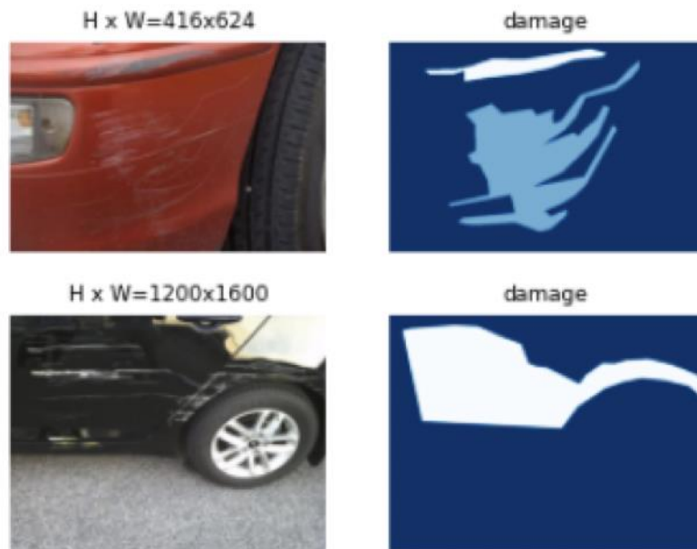
Figure 4 Example images and generated masks of damaged surface

Bounding boxes are calculated from the coordinates of the masks and plotted on the entered images ( Figure 5 ).