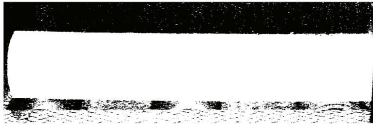
Figure 3 Mathematical algorithms help to identify edges of rolling material in gathered images

The processing method ( Figure 3 ) will be based on simple algorithms to achieve the desired speed and the system is stable and robust. Under laboratory conditions, MATLAB and its image processing library were used. The goal of this process is to define the inlet and material coordinates. These data can be used to control the technological process, visualization, or as a source of preventive shutdown of the material shift if the curvature rate could cause damage to the rolling stand or manipulator.