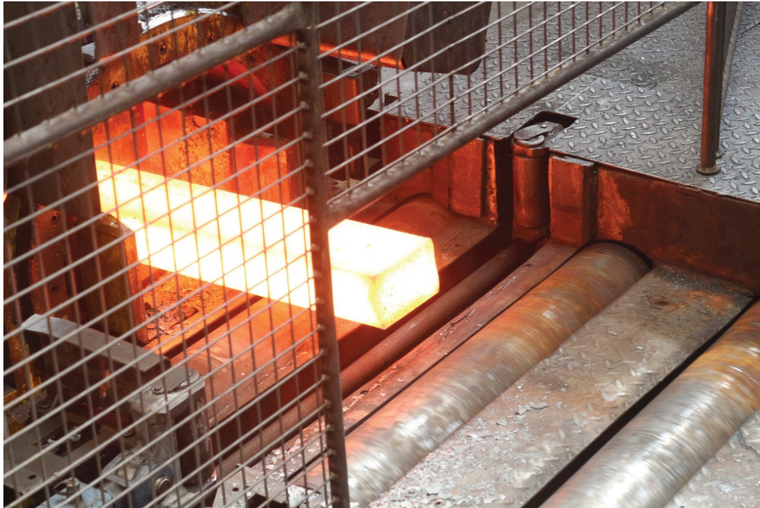
Figure 1 Rolling material and partly visible round manipulator

in the material. Material distortion and curvature occurs. If the material passes through the rolling mill back and forth during one cycle and does not rotate about its longitudinal axis by 90 °, there is no problem with the entry guidance. If the material is rotated by 90 ° during the rolling process, there is a problem of directing the curved material to the correct inlet.