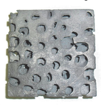
Fig. 6 Casting (cast iron with lamellar graphite) - type A