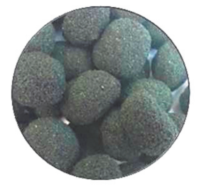
Fig. 9 Precursors - Furan moulding mixture (regular shape and size)

Porosity of produced castings amounted to 63 %. Precursors allow good disintegration after casting.