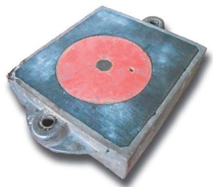
Fig. 2 Mould made from commonly used green sand

Porosity of produced castings amounted to 60%. Precursors allow good disintegration after casting. The disadvantage of these precursors is their irregular shape, which is determined by uneven tumbling of the cullet due to non-uniform hardening of the default core mixture. Therefore, new technology of precursors manufacturing has been proposed - use of moulding mixture bonded by furan resin. This way of manufacturing of precursors should ensure the achievement of the same size, shape and the resulting characteristics of precursors.