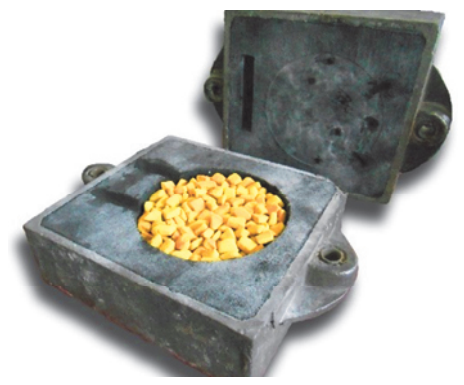
Fig. 3 Mould filled with precursors