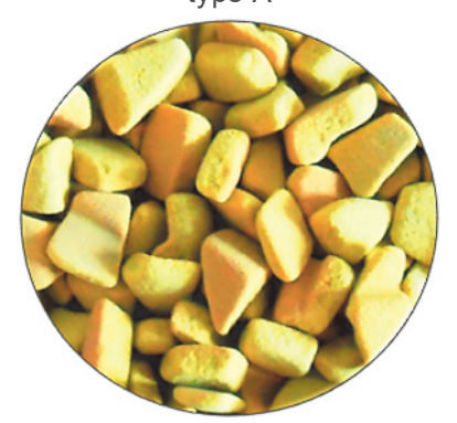
Fig. 8 Precursors - Croning process (irregular shape and size)