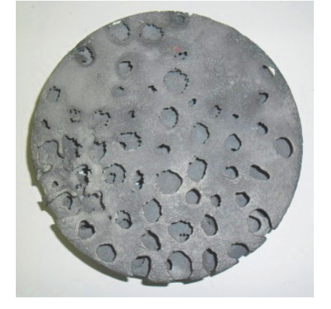
Fig. 7 Casting (cast iron with lamellar graphite) - type B