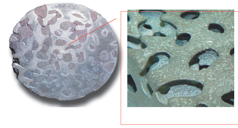
Fig. 4 Final casting and detail of its structure